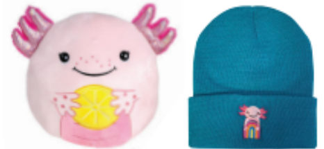
Axolotl Plush Pillow OR Axolotl Beanie