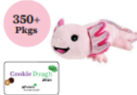
$10 GSLE Cookie Dough OR Small Axolotl Plush