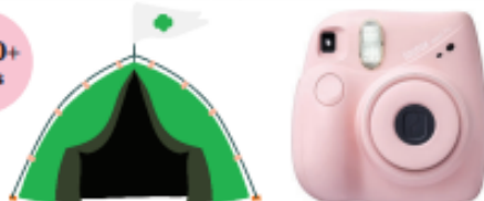
1 Week of GSLE Camp ($445 value) OR Polaroid Camera with Scrapbooking Class at the DreamLab