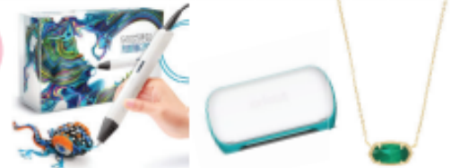
3D Pen, Cricut, and Marketing Class at the DreamLab OR Kendra Scott Entrepreneurial Experience with Necklace