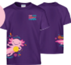
Own Your Magic T-Shirt OR Axolotl Plush Ball Jelly Will receive one, colors vary.