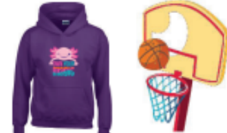
Own Your Magic Hoodie OR 1 Ticket to the GSLE Pelicans Event on Friday, April 5 at the Smoothie King Center