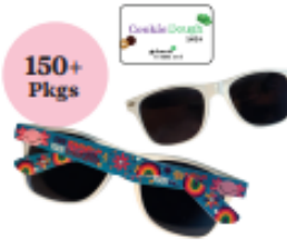
$5 GSLE Cookie Dough OR Theme Sunglasses