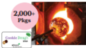
Glass Blowing Class in Slidell OR $100 GSLE Cookie Dough Date chosen by awardee.