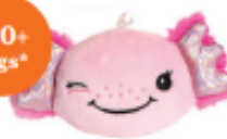
Axolotl Backpack Clip