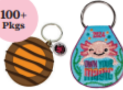
Adventurefuls Keychain OR Theme Cookie Keyring