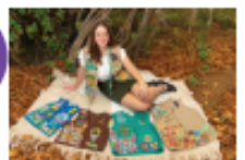
Victoria Hanke Troop 40876