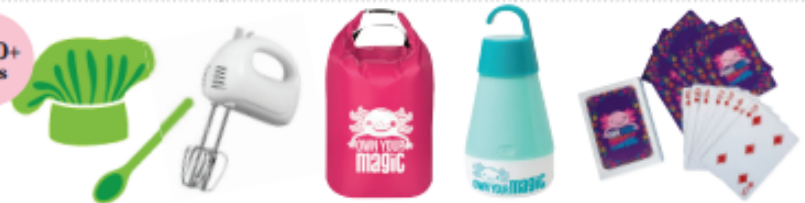
Science of Baking Class at the GSLE DreamLab on Saturday, June 8 with Mixer OR Dry Bag Backpack, Mood Mixer Camp Light, and Playing Cards