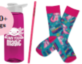
Flair Bottle with Mood Straw OR Theme Socks