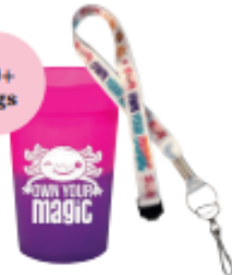
Mood Cup OR Lanyard