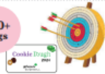
CEO Archery Event at Camp Covington on Saturday, May 18 with Archery Kit OR $40 GSLE Cookie Dough