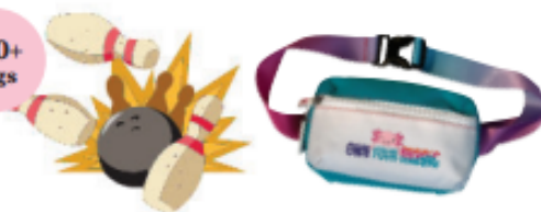
Bowling at Premier Lanes in Gonzales on Friday, April 19th OR Own Your Magic Belt Bag