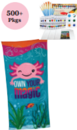
Paint Party at Camp Marydale on Saturday, June 1 with Paint Set OR Beach Towel