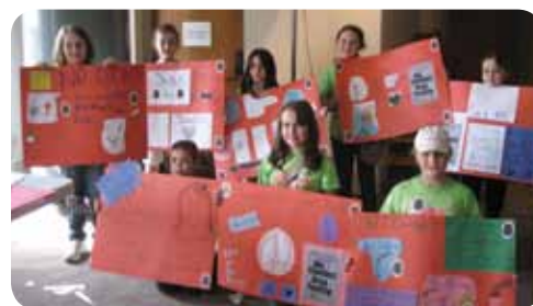
Girl Scouts earn their "High on Life" badge by completing a fun workshop at the Drug Enforcement Administrations' traveling exhibit about the damage drugs cause.