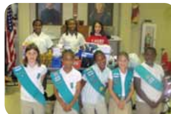
Members of Algiers Troop 40840 collect items on behalf of military troops at their service unit's Father/Daughter Dance.