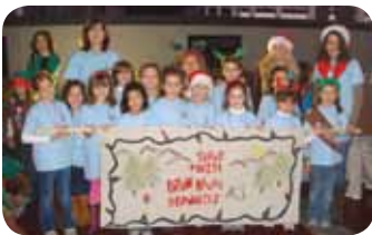
Brownie Troop 10271 is one of the 15 troops who participated in the Baton Rouge Christmas Parade. At right, Slidell Brownie Troop 30232 participates in the French Food Festival parade.