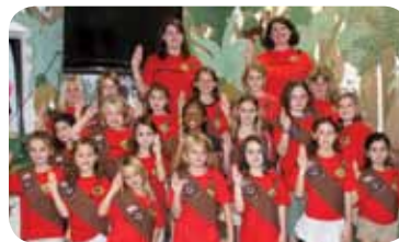
Covington Brownies in Troop 30152.