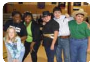
A couple of members of Marrero Troop 525 pose during Service Unit 444's Falling for Girl Scouts Family Hoedown.

One of the ways many service units are electing to participate in the Family Giving Campaign is through service unit events. This year over 16 service units conducted events benefiting the Family Campaign, including a fish fry, a mother/daughter social, a father/daughter dance, a Girl Scout carnival, mother/daughter line dancing, hoedown, plus many more exciting events.