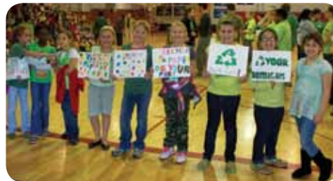
Girl Scout Junior Troop 41014 from John Curtis Christian in River Ridge display hand-made posters at a school assembly during National Recycling Awareness Week to encourage students to recycle. At right, the troop conducts a school-wide food drive for Second Harvest Food Bank, delivering 16 boxes of canned and non-perishable goods that will provide 609 meals to families in need.