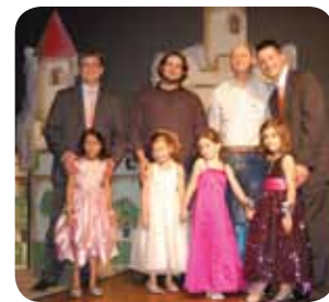
Members of Daisy Troop 10138 pose with their dads at Baton Rouge Kenilworth Service Unit 114's Father/Daughter dance.

To all other service units, you still have time to reach your goal. The deadline to meet your Annual Family Giving Campaign goal is September 30, 2011.