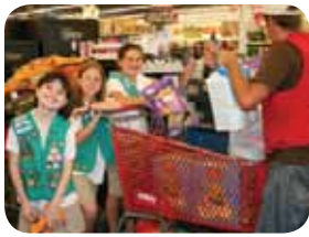
Albany Troop 30116 shop for pet supplies.

The Girl Scout Bronze Award is earned by Girl Scout Juniors in a year-long process that prepares the group or individual for their final project. This service project exemplifies a girl's commitment to helping others and improving her community. Please join us in congratulating the newest