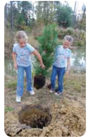
Girl Scouts in Covington Troop 30892 don't have to travel far as they enjoy themselves at Camp Covington.