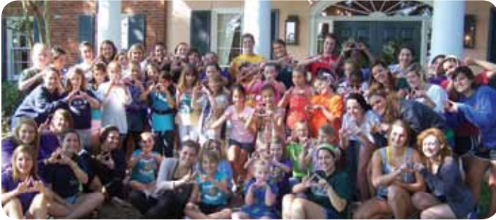
Girl Scouts attending the Art to Wear Workshop hosted by LSU's Kappa Delta Sorority learn the Kappa Delta sign! Each troop brought an article of clothing to paint and Kappa Delta members provided visors, aprons, and socks to be painted and bedazzled.