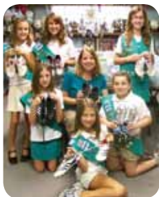
Baton Rouge Troop 10518 displays donated soccer equipment.