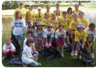
Girl Scout from Abita Springs and Covington participate in the Lake Pontchartrain Basin Foundation's Beach Sweep.