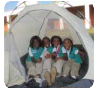
Members of New Orleans Junior Troop 41368 prepare for their camping trip at Tickfaw State Park.