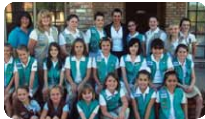
Covington Girl Scout Troop 32021 visits with Mayor Candace Watkins to discuss the responsibilities and challenges of being Mayor.