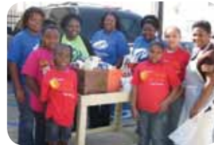
Girl Scouts in Baton Rouge troops 93037, 93033, 92603, and 93000 collect items for the St. Vincent DePaul Dining Room.