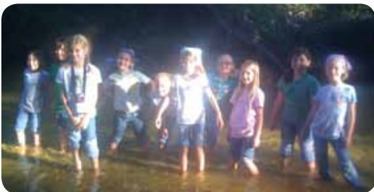
Members of Metairie Brownie Troop 40035 wade in the Bogue Falaya River during their troop camping trip to Camp Covington.