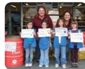
Prairieville Daisy Troop 10210 holds a food drive for Baton Rouge Food Bank.