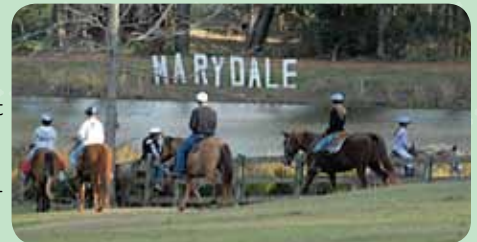
Luncheon proceeds will go to defray cost for upkeep of Camp Marydale.