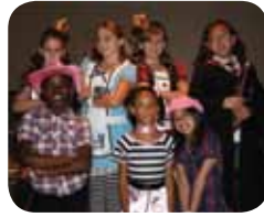
New Orleans Junior Troop 40821 earn their First Aid badge, then witness "First Aid experts in action" as the doctors of Children's Hospital carve pumpkins.