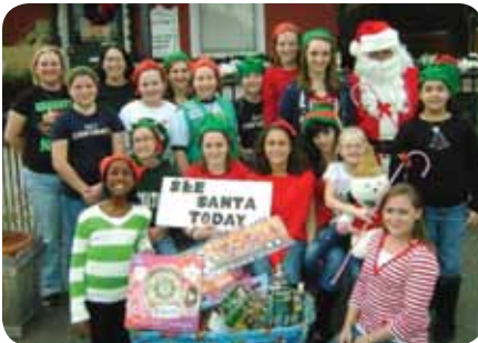
Ponchatoula Troop 30678 sponsors a Toy Drive and pictures with Santa with the toys collected going to needy children in the Hammond and Ponchatoula areas.