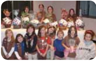
Luling Brownie Girl Scout Troop 21346 display eight baskets they made for local shut-ins with items they collected such as soaps, tissues, cookies, books, writing pads, coffee etc.