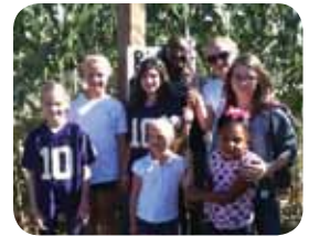
Troop 10103 masters a Corn Maze.