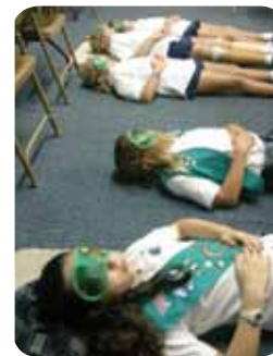
Members of Thibodaux Girl Scout Junior Troop 30783 de-stress, as they earn the Stress Less Badge. At right, they're all aboard Acadian Ambulance as part of earning the first aid patch.