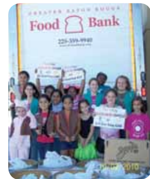
Gonzales Girl Scout Troop 10340 collects over 2,300 pounds of food for food drives they held at two local Ralph's Markets.