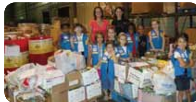
Marrero Academy Daisy Troop 40909 collects over half a ton of food (1079 lbs = 830 meals) which they deliver to Second Harvest Food Bank.