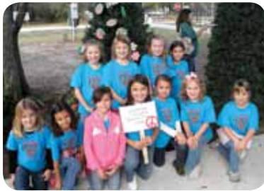
Brownie Troop 30048 of Covington decorate a tree for the Tammany Trace's Holiday of Lights.