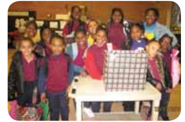
Members of Brownie Troop 20024 of Destrehan are surprised with a visit from two local service people recently returned from an overseas tour, as they and other Girl Scouts stuff 57 shoe boxes for servicemen overseas.