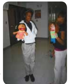
Girl Scouts at Carver Elementary in New Orleans participate in a relational aggression activity.