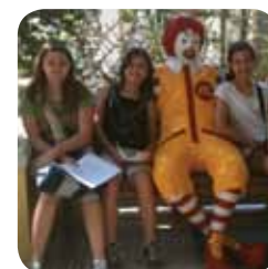
Prairieville Troop 10449 at the Ronald McDonald House.