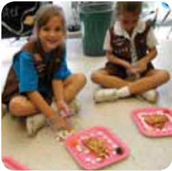
Girl Scout Brownie Troop 30048 of Covington prepare for a future camping trip by making edible fire.