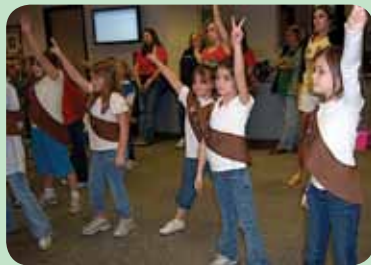
Members of New Roads Troop 10429 have fun staying fit with a new dance routine.