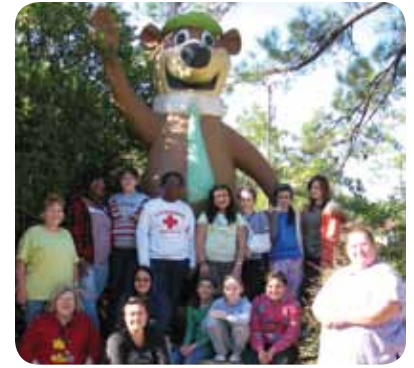
Marrero Troop 40525 camp at Yogi Bear during Rangers Birthday Weekend.