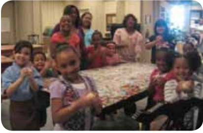
Girls in New Orleans East Troops 40148, 40096, and 40579 learn to make pasta at the Southern Food and Beverage Museum.

These Prairieville Girl Scouts observe one of the experiments demonstrated at LSU's Super Science Saturday sponsored by LSU's Chemistry Department and the Baton Rouge American Chemical Society.