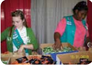
Troop 10803 packs 200 snack bags for the physically and mentally challenged children attending Buster Brown Day at the State Fair.