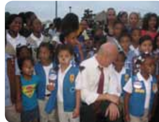
New Orleans Mayor Mitch Landrieu talks to a Girl Scout from New Orleans East during a Night Against Crime event.