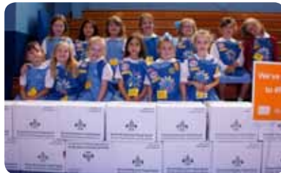
Members of Daisy Troop 42117 in Metairie hold a peanut butter and jelly drive for Second Harvest Food Bank.