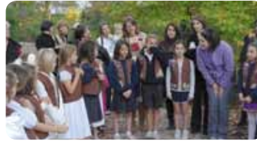
Baton Rouge Brownie Troop 10193 helps a sister troop complete their "bridging to brownies" ceremony at the Hilltop Arboretum.