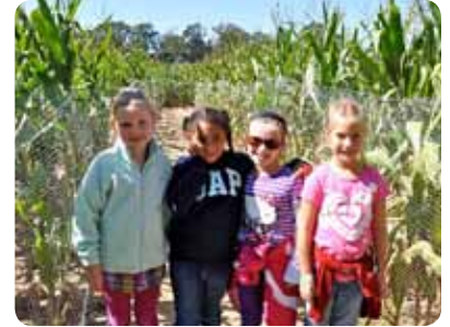
Mandeville Daisy Troop 31017.