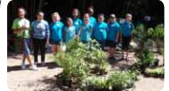
Members of Destrehan Troop 20024 take a field trip to Longue Vue Gardens.