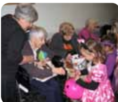
Girl Scouts in Metairie Service Unit 405 meet residents of Colonial Oaks Living Center during a Halloween outing.