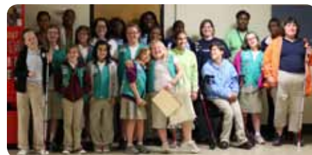
Denham Springs Troop 10380 visits the Louisiana School for the Visually Impaired and made cards for the troops overseas!