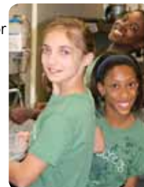
These Girl Scouts are all smiles during Gentilly/Lakeview Service Unit 435’s popular Fish Fry.