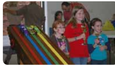
Covington Girl Scouts enjoy a Powder Puff Derby competition where the girls designed and painted their own wooden cars before racing them.