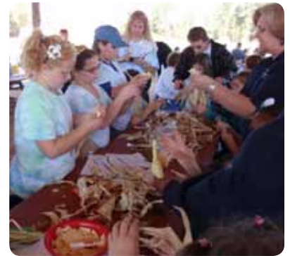
Girls enjoy making corn husk dolls.