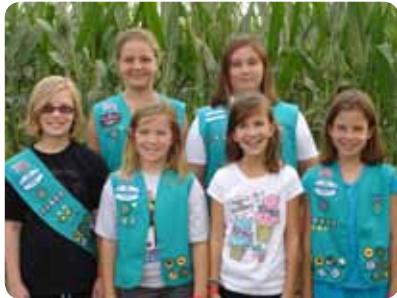
Baton Rouge Junior Troop 10803.