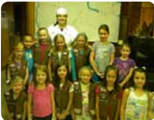
A Pro-start culinary student helps Brownies in Livonia Troop 10013 with their cooking skills.