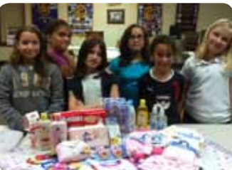
Members of Houma Junior Troop 20497 put together a basket of baby items for the parents of the first baby girl born on October 31, in honor of founder Juliette Low's birthday.