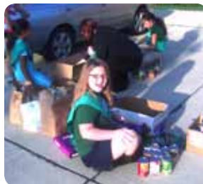
St. Rose Junior Troop 20165 sort cans during a food drive they held in conjunction with St. Rose Elementary's 4-H club. They collected a total of 286 non perishable food items and toiletries which were delivered to Social Concerns in Luling, St. Charles Boromeo, and St. Charles United Methodist Church.