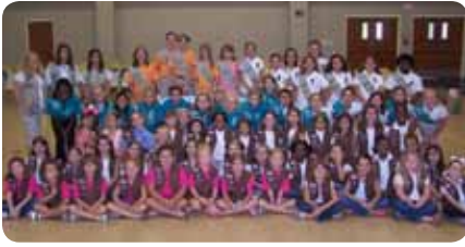
Girl Scout ceremonies recognize accomplishments, pass on traditions and reinforce the values of the Girl Scout Promise and Law. Seventy-one Girl Scouts bridged to the next level in Girl Scouting at Prairieville Service Unit 131's annual bridging ceremony.