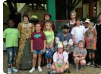
Schriever Girl Scout Juniors in Troop 20522 earn their Theater badge during the Renaissance Festival Workshop.