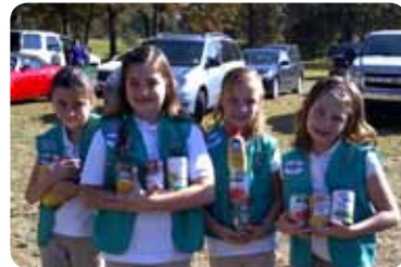
Members of Loranger Junior Troop 30539 carry in donations for the food bank.