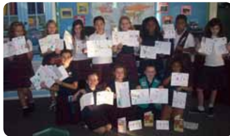
New Orleans Junior Troop 40234 show some of the cards they created for the Holiday Mail for Heroes.