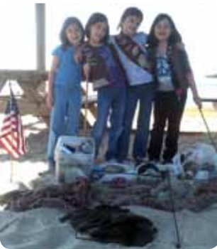
Brownie Troop 30181 of Slidell pick up trash at Pontchartrain Beach, earning them their beach Clean-up Fun Badge.