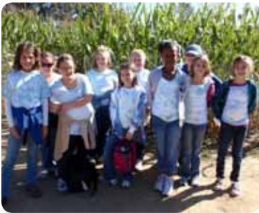
Junior Troop 20024 from Destrehan.