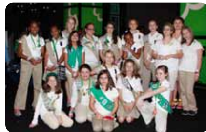
Eighteen Girl Scouts from Gretna Cadette Troop 40457 and Junior Troop 40813 attend the National Convention, after 1½ years of money-earning activities to afford the trip to Houston.

Proposal 3 was referred to the Task Group to study the Dues Structure and Membership Processes. The Proposal had been to allow membership dues to change from Oct. 1 – Sept. 30 to commencing on the date of registration of the member.