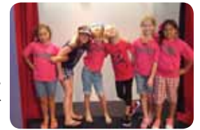
Brownie Troop 10237 from Watson enjoy a trip to the Children's Discovery Center in Hammond.