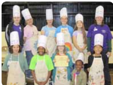
Members of the New Orleans team wear chef's hats to go with this year's theme of "Food Factor."

The council hopes to increase the number of teams competing in 2012.