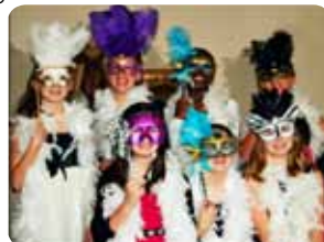
St. Pius X Cadette Troop 40821 dress up for a Night at the Opera.