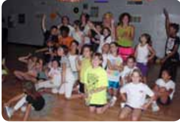
Girls get silly at a Girl Scout Zumba class!