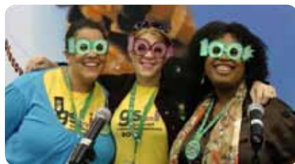
Celebrating 100 years!