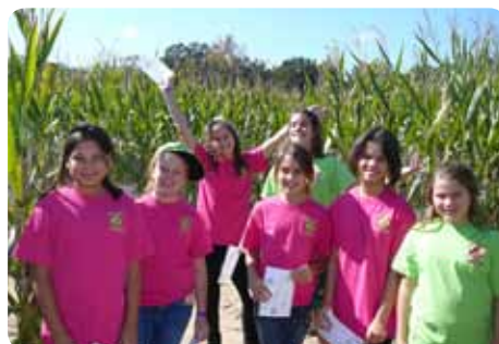
Harahan Cadette Troop 40296.