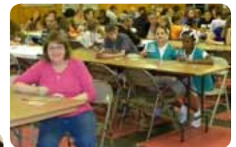
St. Charles Parish Service Unit 216 holds a cake bingo!