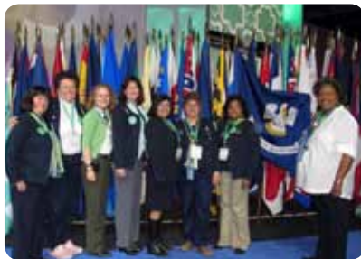
Delegates from Girl Scouts Louisiana East.

Results from the national council session can be found online at www.gsle.org/100/nationalsessionresults.asp Proposal 1 was adopted as amended which