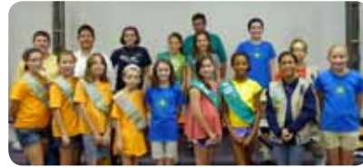
Girl Scout participants from six troops learn about nuclear science from Entergy employees at the River Bend Nuclear Plant during a Girl Scout Journey workshop.