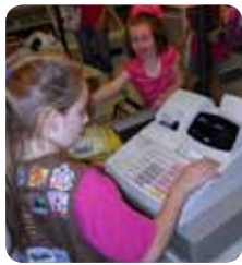
A Gonzales Girl Scout "rings up a customer" in the Winn-Dixie exhibit at the Louisiana Children's Museum.