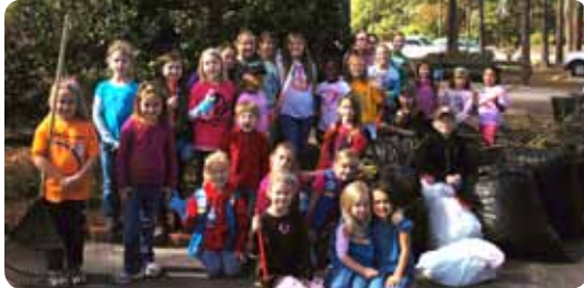
Slidell Troops 30194, 30052, and 30111 help to "Clean Up Slidell!"