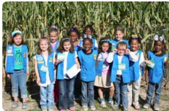
Daisy Troop 10527 of Central enjoy their first troop outing!