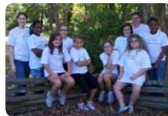
Baton Rouge Junior Troop 10263 visits the Oakley Plantation.