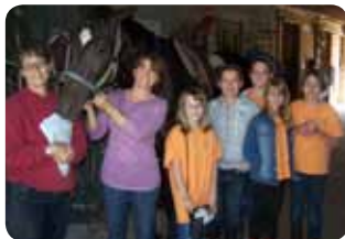
Members of Girl Scout Cadette Troop 10040 visit the Fantasy Oak Stable and Farm in Prairieville.