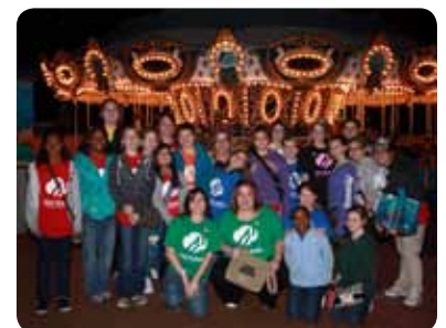
Gretna Girl Scouts enjoy the Aquarium in Houston during their trip to the National Convention.