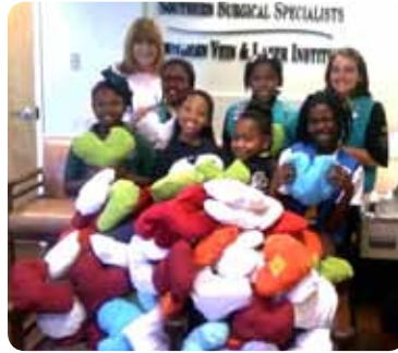
Gretna Junior Troop 40781 sew 100 heart-shaped pillows for patients recovering from breast cancer.