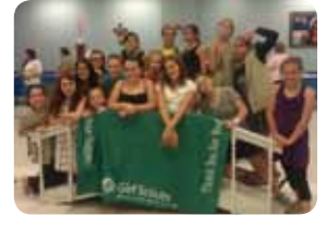
Metairie Girl Scouts in Troop 40106 bridge from Juniors to Cadettes!