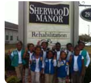
Baton Rouge Troops 10118 and 10448 prepare and hand out fruit bags to the elderly.