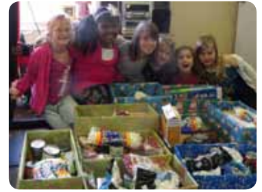
Brownie Troop 40782 holds a food drive at Harahan Elementary, collecting over 260 items that provided nine boxes of food for families in need from the school.