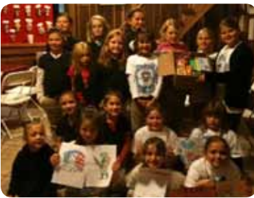
Girl Scout Juniors in Troop 30474 in Pine have adopted a soldier serving in Afghanistan to whom they ship monthly care packages.