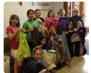
Brownies in Metairie Troop 40635 collect over 400 coats for WGNO-TV's Coats for Kids drive.