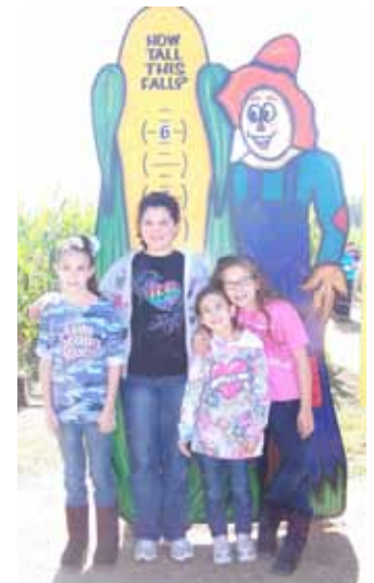
River Ridge Troop 41014.