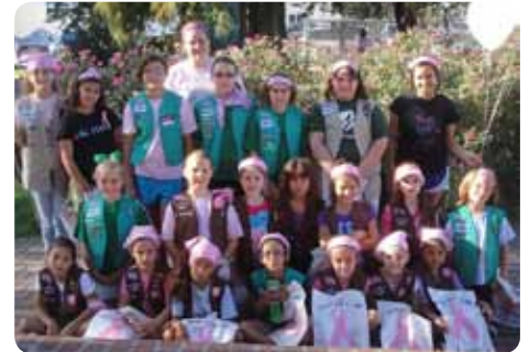
Girl Scouts from St. Bernard Parish help out in the local Breast Cancer Walk.