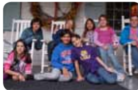
Cadette Troop 40354 of Metairie rest on the porch of the Myrtles Plantation during a weekend trip to Camp Marydale.