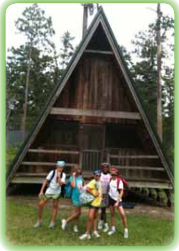
Members of Troop 40821 prepare to head out for a hike in the woods.

Get ready for a fun weekend in the wild, where you and your team (team assigned at the event) will participate in survival games to include canoeing, building both a fire and a shelter, ropes course, and much more! This weekend for Girl Scout Juniors-Ambassadors begins 6 p.m. Friday, November 11, and ends 12 p.m. Sunday, November 13, with camporee activities on Saturday from 8 a.m. to 6 p.m. Bake your own special birthday cake or other goodies beforehand to bring and share with all your sisters at dinner on Saturday night as we celebrate Girl Scout founder Juliette Low's birthday. The fee to attend is $40 per person including adults, which includes Saturday breakfast, lunch, and dinner and all camping and presenter fees. Deadline to register is October 21.